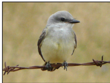
Western Kingbird

After a slow start in the pre-dawn darkness, with only one rail at Ellis Creek, and no owls