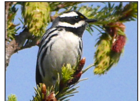
Black-throated Gray Warbler