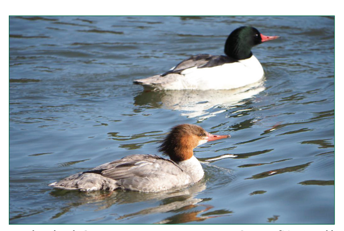
Female and Male Common Merganser