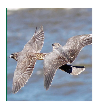
Juvenile Peregrine Falcon Flight Testing

Park along the street, near the Presbyterian Church, on the corner of Pacific and McDonald Ave. We will meet there and walk over to the original main entrance to the cemetery together. For Info: 707-526-5883.