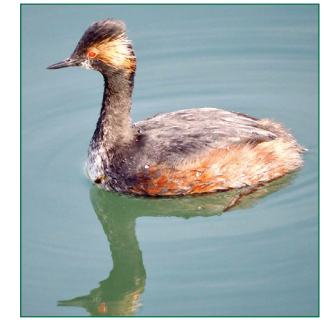
Eared Grebe

We will meet at Port'o Bodega Marina to begin, then bird around the bay towards Campbell Cove. Moderate rain will cancel. It can be windy, so layer up to keep warm. Carpooling is recommended. For info: 707-526-5883.