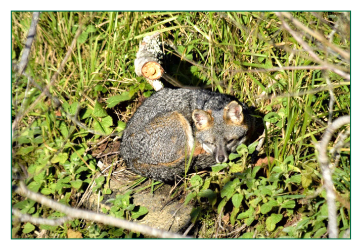
Area 15, Willow Creek Road, Sleeping Gray Fox

Willow Creek Road, David Berman-Leader: It started out cold, 34 degrees, clear and almost windless; the birds seemed to be at REI, buying thermal hoodies. We had an outstanding mammal day. We