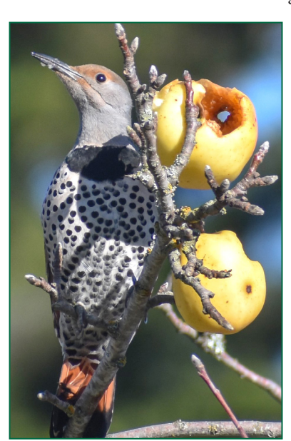
Area 3 -Valley Ford Road, Northern Flicker

Valley Ford, Kaitlin Magoon-Leader: This year, the Area 3 team began our count day in the town of Valley Ford. Our territory is mostly open ranch land, so the local bird population had to contend with frost-covered fields and frozen-over ponds throughout the morning. Our mid-morning arrival at the nearby Valley Ford wetlands also coincided with a Peregrine Falcon on the hunt