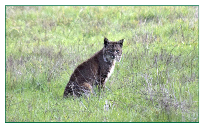
Area 15, Willow Creek Road, Bobcat

Harrison Grade, Carolyn Johnson-Leader: Our day began with our team of seven meeting after completing COVID home tests either that morning or the night before. We had 2 teams and 2 cars. We ventured out into clear skies and frozen ground, thankful for the rain holding off for one more day. Our individuals and species were lower than average. A total of 59 sp. (avg 64) and