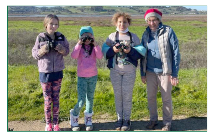
2021 Petaluma CBC for Kids at Shollenberger Park

The Spring Feather Fest is planned for Saturday, May 7, 2022. Sign-ups will be an email to 33sheryln@gmail.com or call or text 707-318-6760.