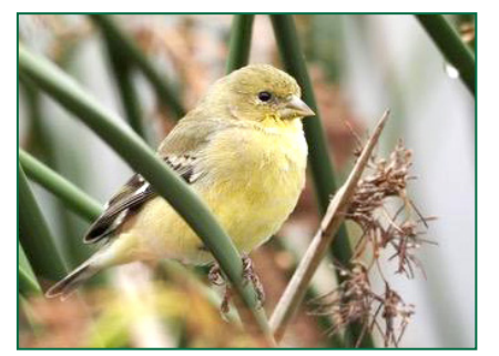
Lesser Goldfinch, Ellis Creek

Bodega Bay. 1500 Porto Bodega sits at the north end of Bodega Bay. From Highway 1 take Eastshore Road. At the Stop sign, after stopping, go forward for a city block length until you get to the boat launch facilities. Turn right and Janet will meet you in the big parking lot. We will bird around the Bay. Heavy rain cancels. **To reserve a space, please call Janet Bosshard, (707) 526-5883. Please arrive on time. Use this number only on the day of the walk if you are lost or cannot attend: (707) 480-3432.