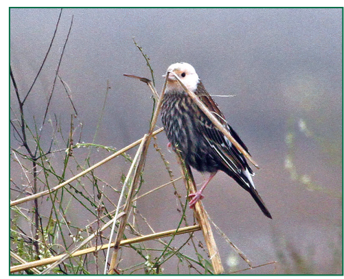
Leucistic Female Red-winged Blackbird

Foothill Regional Park, Windsor. Take Hwy 101 to 1351 Arata Lane, turn right, go 1.3 miles. Parking lot is on the left or park on the street. Parking permit is required in the lot. We will walk around the pond and through the Oak woodlands. Heavy rain will cancel the walk. **To reserve a space, please call Janet Bosshard, (707) 526-5883. Please arrive on time. Use this number only on the day of the walk if you are lost or cannot attend: (707) 480-3432.