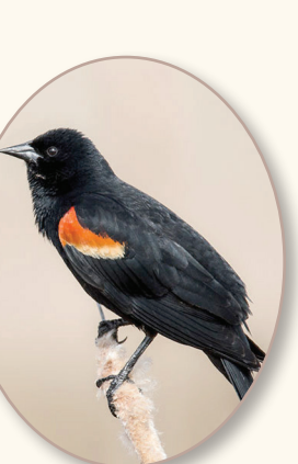
Red-winged Blackbird