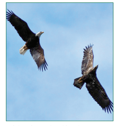
Adult and Juvenile Bald Eagles

Take Hwy 101 North, take Windsor River Road exit, turn left and proceed to Eastside Road, turn left, go about 2 miles. Park permit is required. We'll meet back by the Redwood grove/restrooms. For info: 707-526-5883.