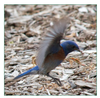
Western Bluebird

Meet at Jimtown Store (6706 CA-128, Healdsburg). We'll move to a safe shoulder from there, arrange carpools and proceed up the grade. For info: 559-779-5211.