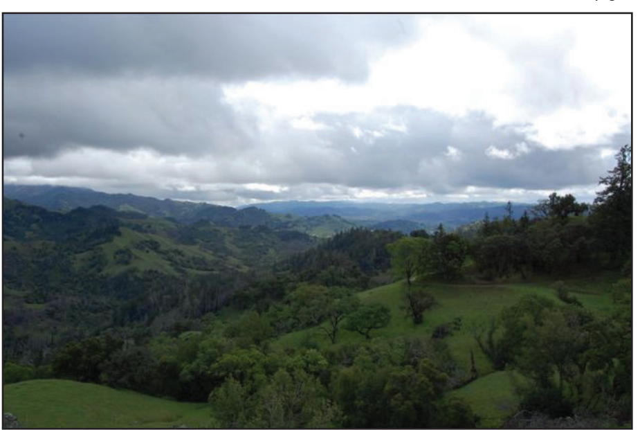
Modini Ingalls Ecological Preserve