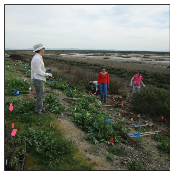
Junior Audubon joins PRBO for wetland restoration at Sonoma Baylands.