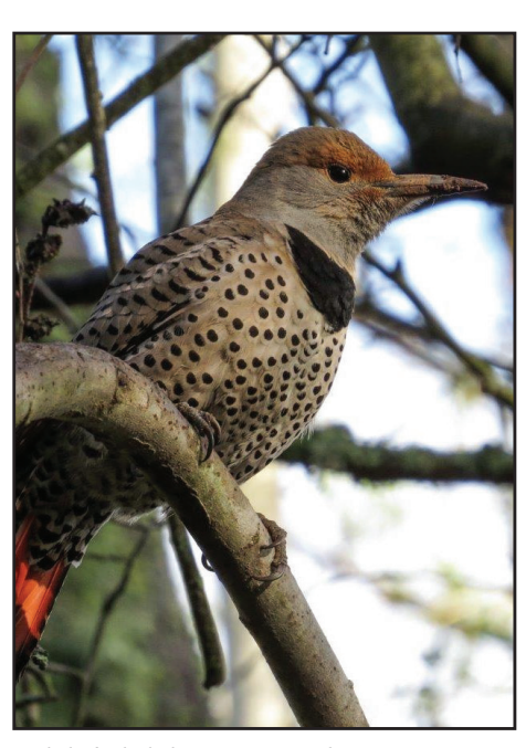
Red-shafted Flicker at Spring Lake

The preserve is located at 2130 Pepperwood Preserve Road, approximately midway between the towns of Santa Rosa and Calistoga off of Franz Valley Road and adjacent to Safari West. For more information about Pepperwood Preserve and its programs, visit http://www.pepperwood-preserve.org.