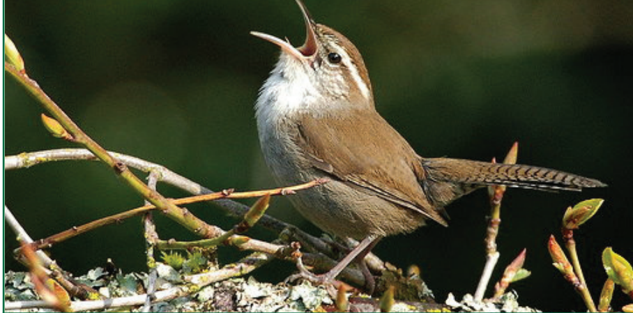
Find us on Facebook for conservation alerts, birdwalk reminders, special announcements and more.