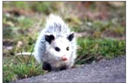
Opossum at road edge

Can we do more locally, regionally, and statewide in California to support wildlife corridor identification, awareness, and preservation? The answer is YES.