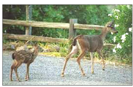
Doe and fawn