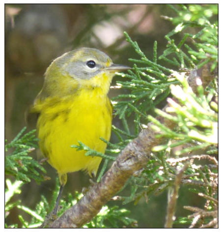
Immature Pine Warbler

North Beach and Limantour Spit. The open fields in the area are also important for open-country migrants and winterers, including shorebirds such as the localized Pacific Golden-Plover, which winters at just a handful of sites in California. Finally, the scattered clumps of trees associated with ranch yards within this IBA have long been known as important migration hotspots, with hundreds of songbirds crowding into planted groves of cypress, particularly in fall. The Pt. Reyes