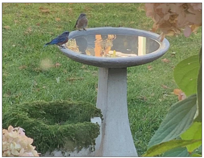
Western Bluebirds in downtown Santa Rosa

Note from Gordon Beebe: Luckily, many of the birds Linda mentions are already safe in their winter homes at this time of year – the flycatchers, tanagers, martins, and buntings. The ones hardest hit were the resident birds - the thrashers, gnatcatchers, Bell's Sparrow, and other resident species. But what happens when the migrants return next spring? Some might be able to move to an unburned area, but if it is already occupied, then there is no home for them. Others, such as the Lazuli Buntings, are frequently found in burned-over areas, so they may actually do okay when they return.