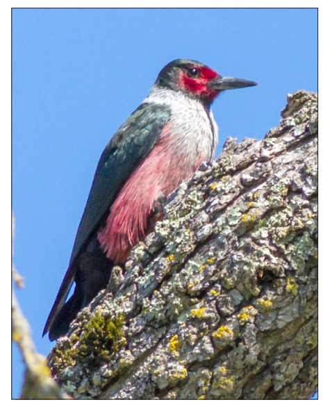
Lewis's Woodpecker – Taylor Mountain Regional Park

Stretching from the Bering Strait off the coast of Alaska to Patagonia in South America, the Pacific Flyway ranks as one of the greatest migratory pathways in the