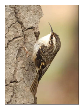
Brown Creeper at Spring Lake

Please join us for 2 hours of seasonal natural joy for young people out in nature. Hosted by Sonoma County Regional Parks and Madrone Audubon. For sign up and directions, visit https:// parks.sonomacounty.ca.gov/ and look for the activities guide and upcoming events. Meet at Shady Oaks Picnic Area near the Environmental Discovery Center, Violetti Road. Refreshments served after the walk. Questions: Call 707-241-5548.