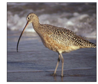
Long-billed Curlew

As our planet warms, birds will relocate to escape heat --- hundreds of North American species may drastically shift their ranges in decades ahead, responding to rising temperature and other threats from climate change.