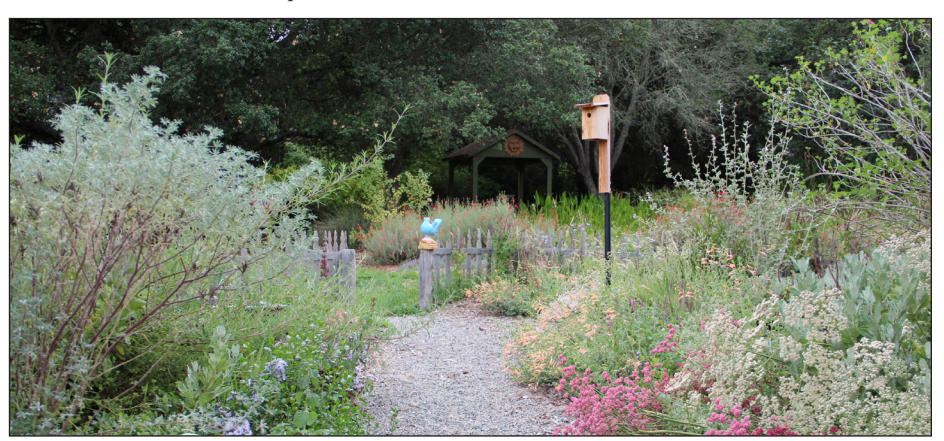
Native Songbird Care & Conservation Habitat Gardens

If creating and enhancing habitat gardens are interests of yours and you'd like to share your ideas or volunteer in this area with us, please contact me at cheryleharris@sbcglobal.net or 707-294-6423.