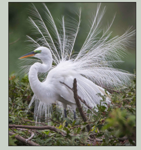
Great Egret stretch display

Herons and egrets are recognized around the world as symbols of wetland health. Such symbolism is well-substantiated by the sensitivity of these birds to wetland quality and by their roles as powerful wetland predators. As a result, the habits and needs of herons and egrets provide key perspectives for protecting the wetland landscapes in our region. This program offers an inside look into the lives of these elegant birds, with insights from ongoing studies at Audubon Canyon Ranch (ACR) on the conservation of wetlands, the effects of climate change, and the protection of heronries. John P. Kelley, Director of Conservation Science at ACR, will also hare early updates on ACR's new Heron and Egret Telemetry Project, which uses BPS transmitters and observations of known individuals to track the daily lives