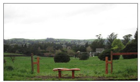
Sunset View Area

Saturday mornings have been added to our Monday-Friday available schedule observations and data gathering. We would welcome 2-3 additional