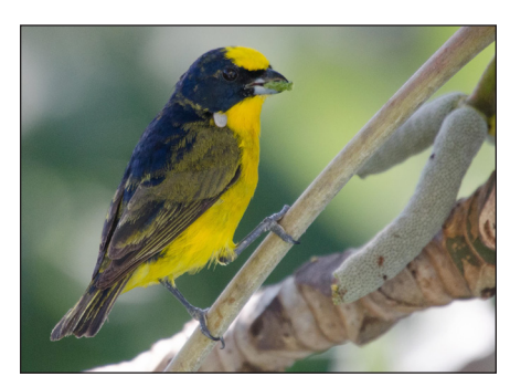
Young male Thick-billed Euphonia

Now the Atlas project is on to the next phases – reviewing notes (mostly finished now I hope!), wrapping up the documentation, and thinking about how to present all the work that everyone has done on the Atlas project. But there is also a carryover to other birding experienc-