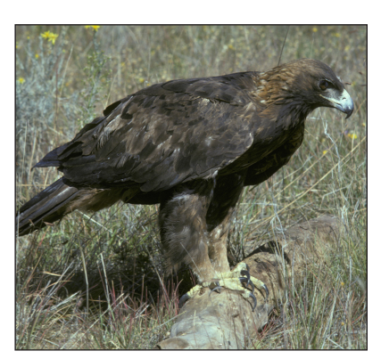
American Golden Eagle

This beautiful film can be accessed through Google, Sony Pictures Classic Release, or through Netflix or other streaming sources. JJ gives this film a 5-star (top) rating.