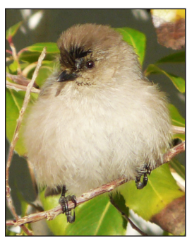
Bushtit

we actually found more birds breeding, when what really happened was we had more time to find the ones that were already there.