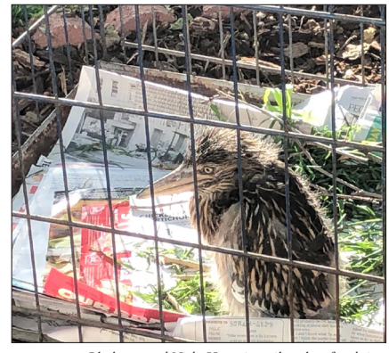
Black-crowned Night Heron juvenile, calm after shrimp

nesting and a change in the number of falling nestlings. We will surely observe for this and may know more at the end of the season. When some of the shelter in place restrictions were lifted by the Governor, outdoor photography was an approved outside activity and, the next day, a photographer tripod with and