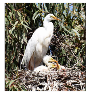
Great Egret family

Condeso, created an activity book called Meet Ephran the Great Egret (available in English and Spanish) for K-2 students and a mapping activity called A Safe Place to Nest for grades 3-5. International Bird Rescue (IBR), the non-profit organization that rehabilitates many chicks originating from the Lincoln School/W. 9th St. nesting site, provided a craft project inspired by their work: a parent bird