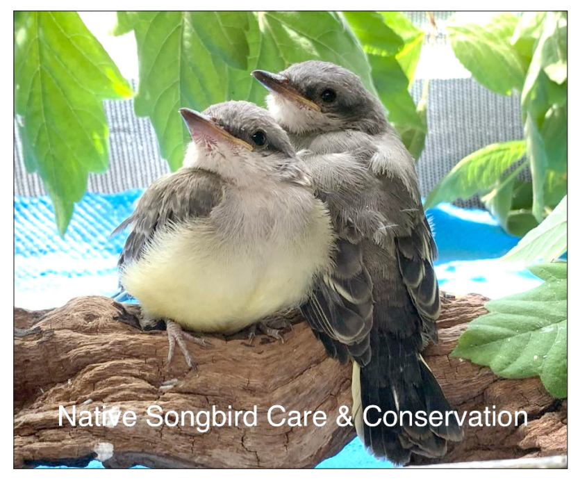
Western Kingbird Fledglings

Fortunately, as an essential service, we were able to remain open and continue our work helping injured and orphaned songbirds. Five of our 21 volunteers were able to return and participate in our hands-on work with the birds. To bolster our workforce and maintain