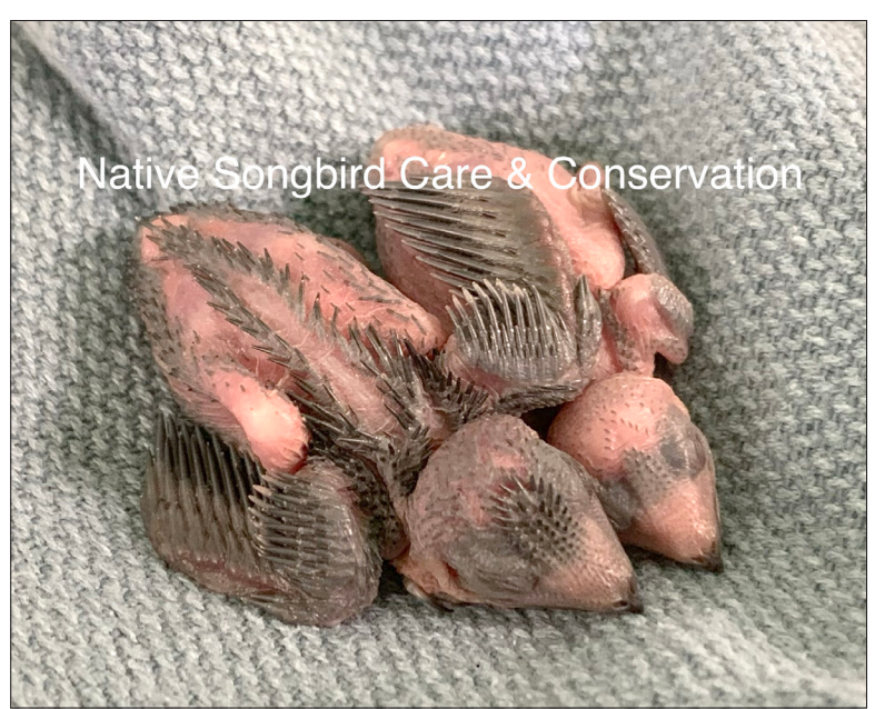
Vaux's Swift nestlings

To maximize our resources, we used texting to communicate with the public rather than phone calls. This made communication more efficient and significantly reduced time spent on the phone – every second counts when you're feeding 200+ baby birds every 20-30 minutes from sunrise to sunset! During the peak of the season, June and July, we limited the species we accepted to obligate insectivores only and referred species outside of that group to colleagues at other facilities. A mid-season state-wide mealworm shortage threw us a bit of a curve ball, but we managed to find