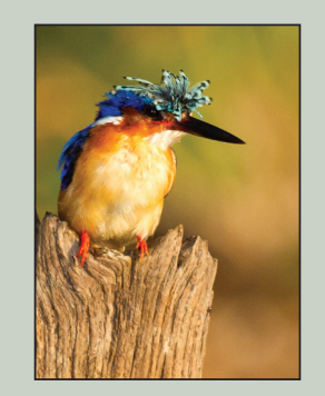
Malagasy Kingfisher

Madagascar has been separated from other land masses for over 90 million years. It has an assortment of life forms found nowhere else on earth. Among them are five families of birds, half the world's chameleons, all the lemurs on earth, and some spectacular insects. We'll make a brief stop in South Africa, and then hurry on to this remarkable island. The concepts of endemism and adaptive radiation will be illustrated with colorful images of Madagas-