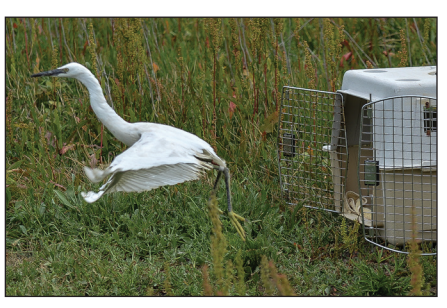
Snowy Egret

Madrone Audubon's "big nest under the trees" contributes to the collaborative effort and interfaces with the urban resi-